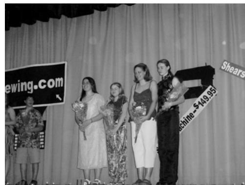
Alternates for NYS Fair