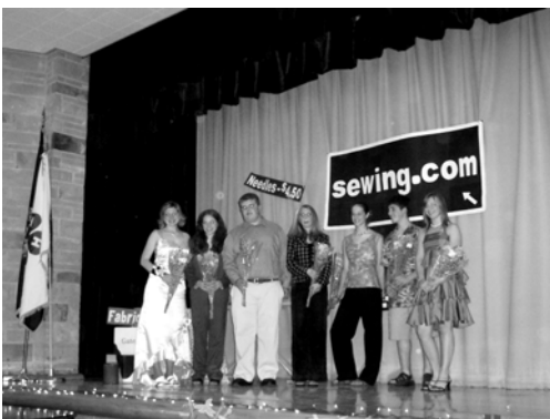
Chosen for NYS Fair